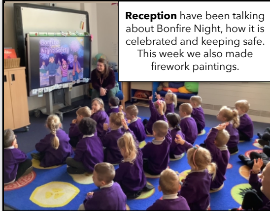
Reception have been talking about Bonfire Night, how it is celebrated and keeping safe. This week we also made firework paintings.