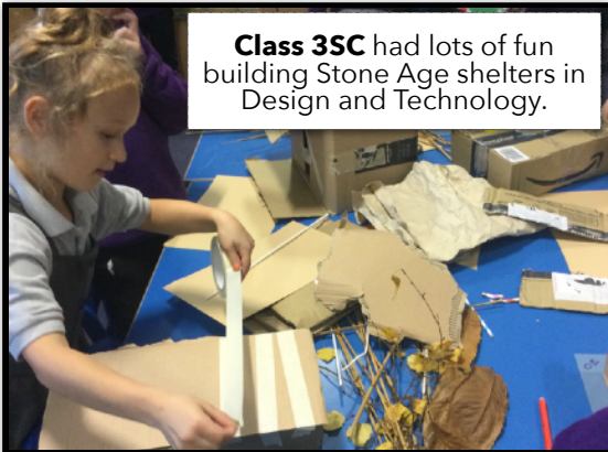
Class 3SC had lots of fun building Stone Age shelters in Design and Technology.