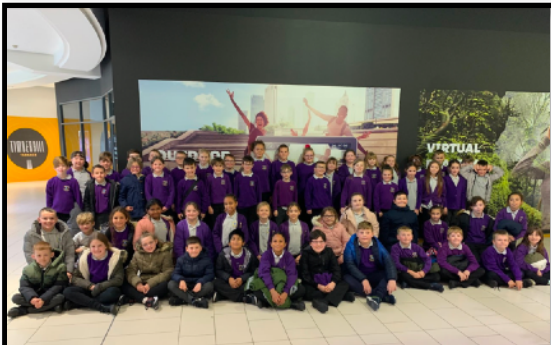
Year 5 enjoyed going to the cinema to see The Railway Children Return. The film was very thought provoking.