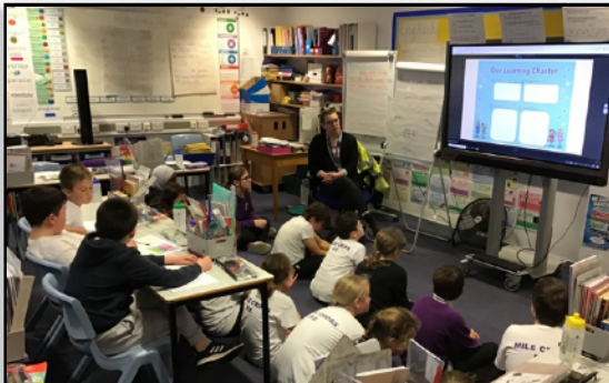
In Life Skills, Year 6 have been considering their rights and responsibilities as children.