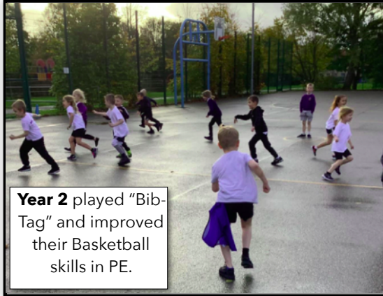
Year 2 played "Bib-Tag" and improved their Basketball skills in PE.