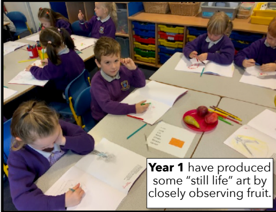
Year 1 have produced some "still life" art by closely observing fruit.