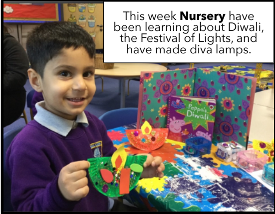
This week Nursery have been learning about Diwali, the Festival of Lights, and have made diya lamps.